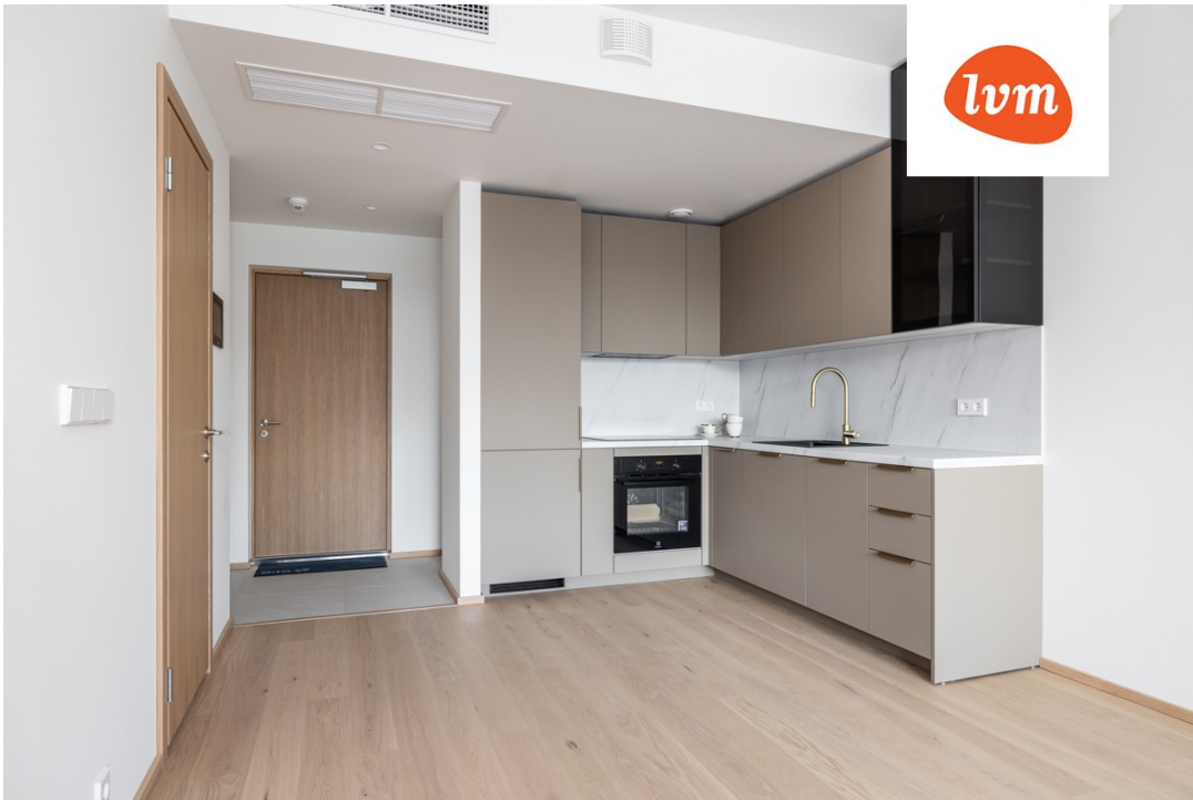
????????, Pärnu mnt 137