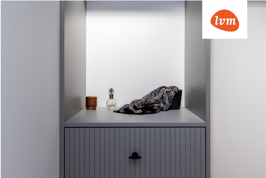
Pärnu mnt 137