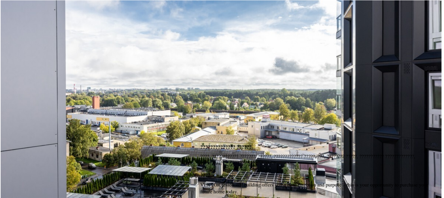
????????, Pärnu mnt 137