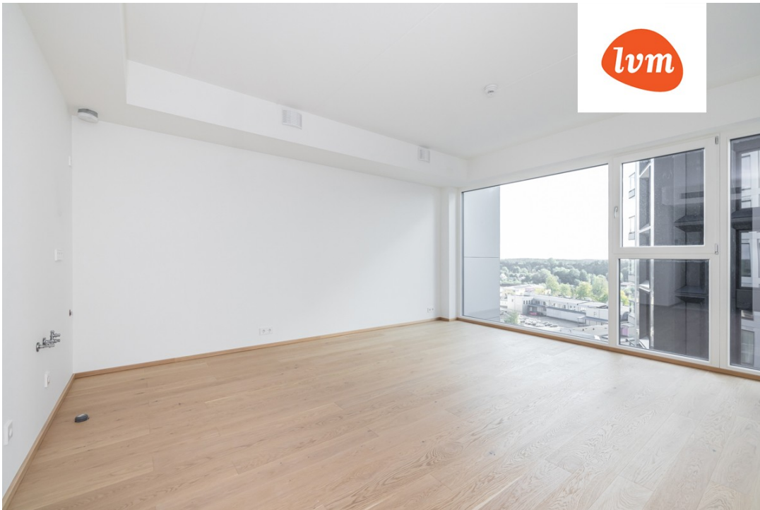
????????, Pärnu mnt 137