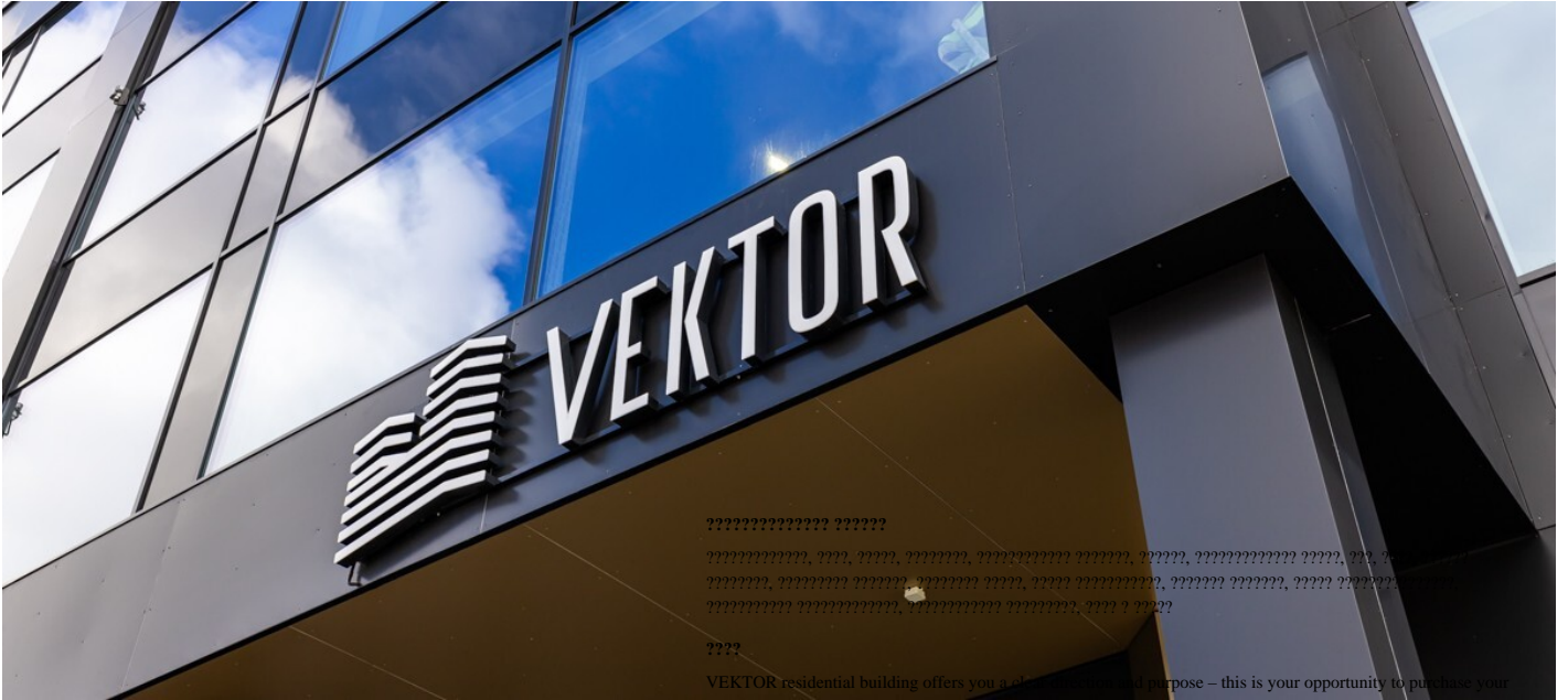
????????, Pärnu mnt 137