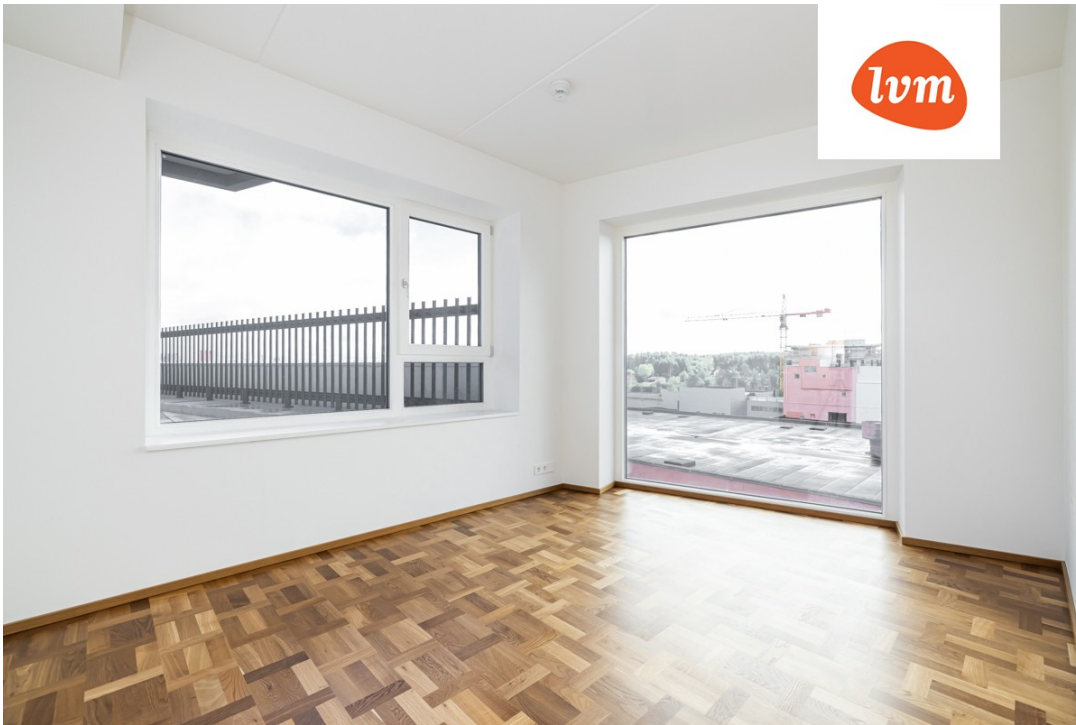
????????, Pärnu mnt 137