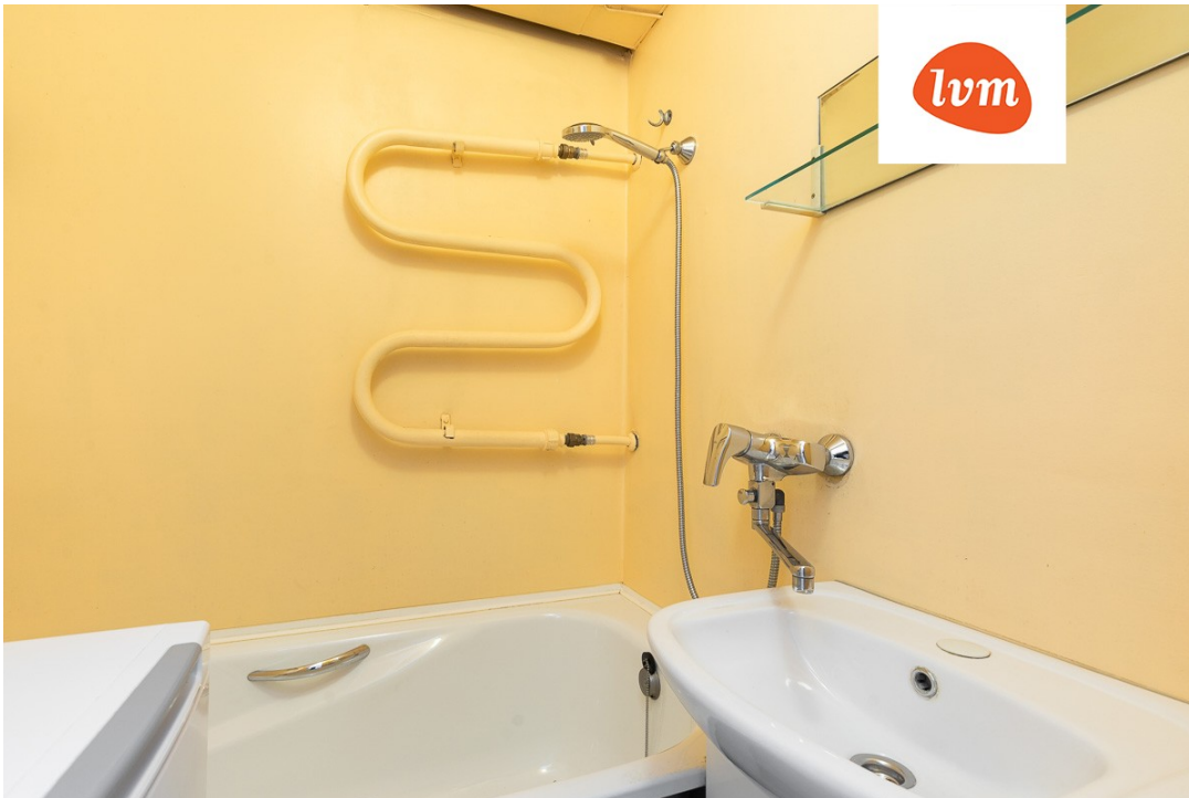
Sõpruse pst 1