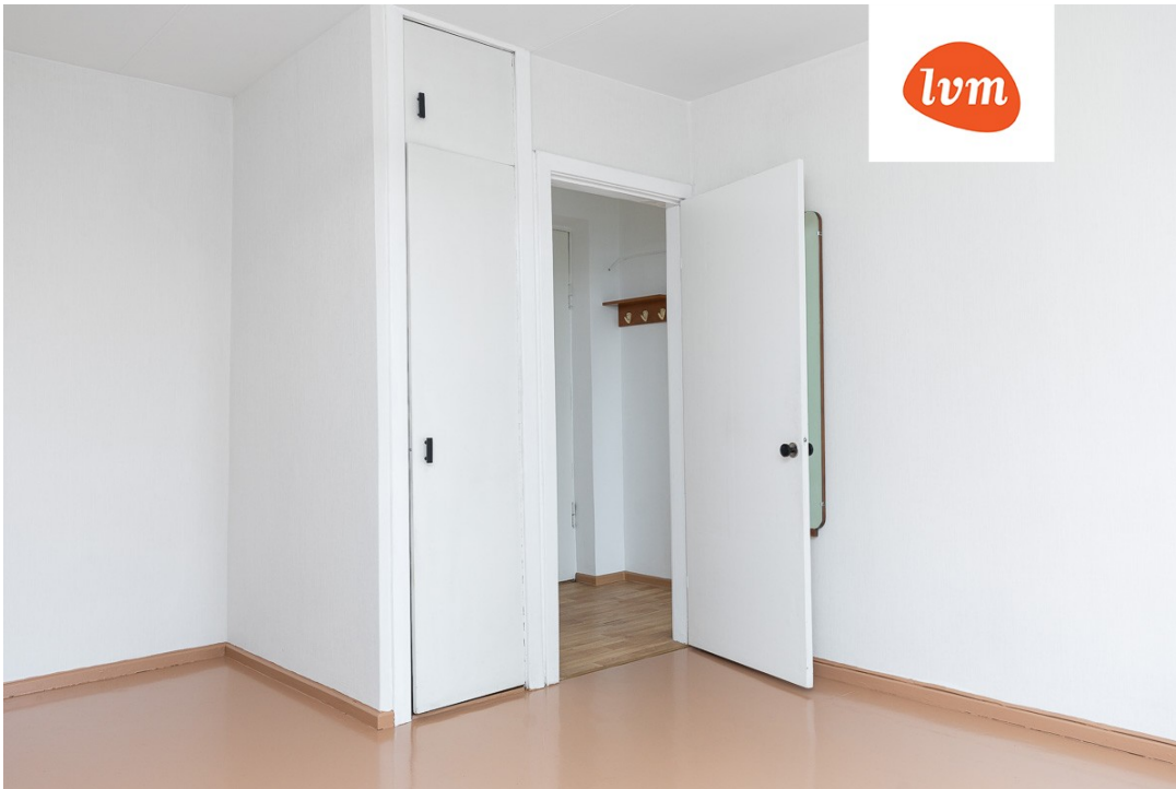
????????, Sõpruse pst 1