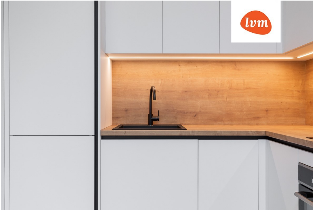
Pihlaka 24-8 I korrus