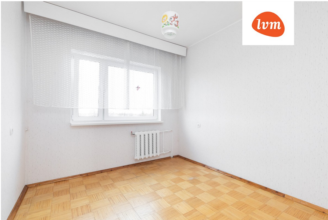
????????, Ringtee 12