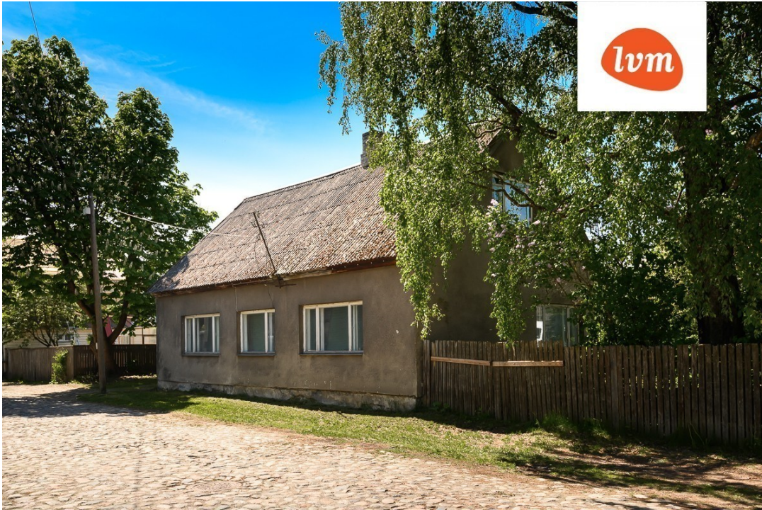
Kalamehe 1 I korrus