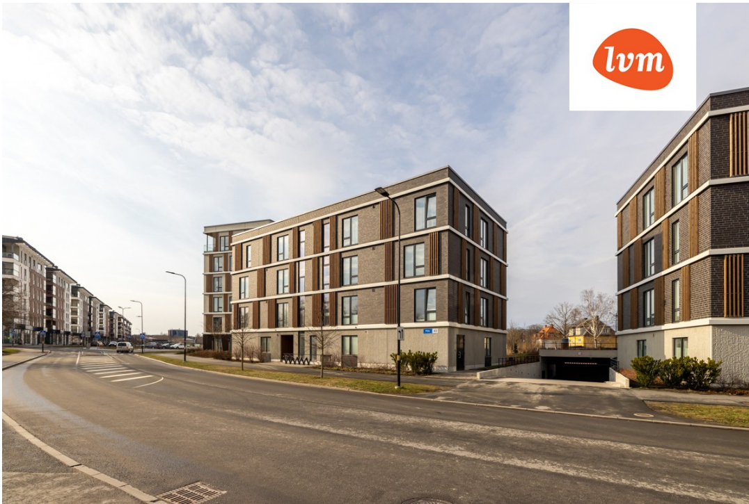
????????, Pille 4/2