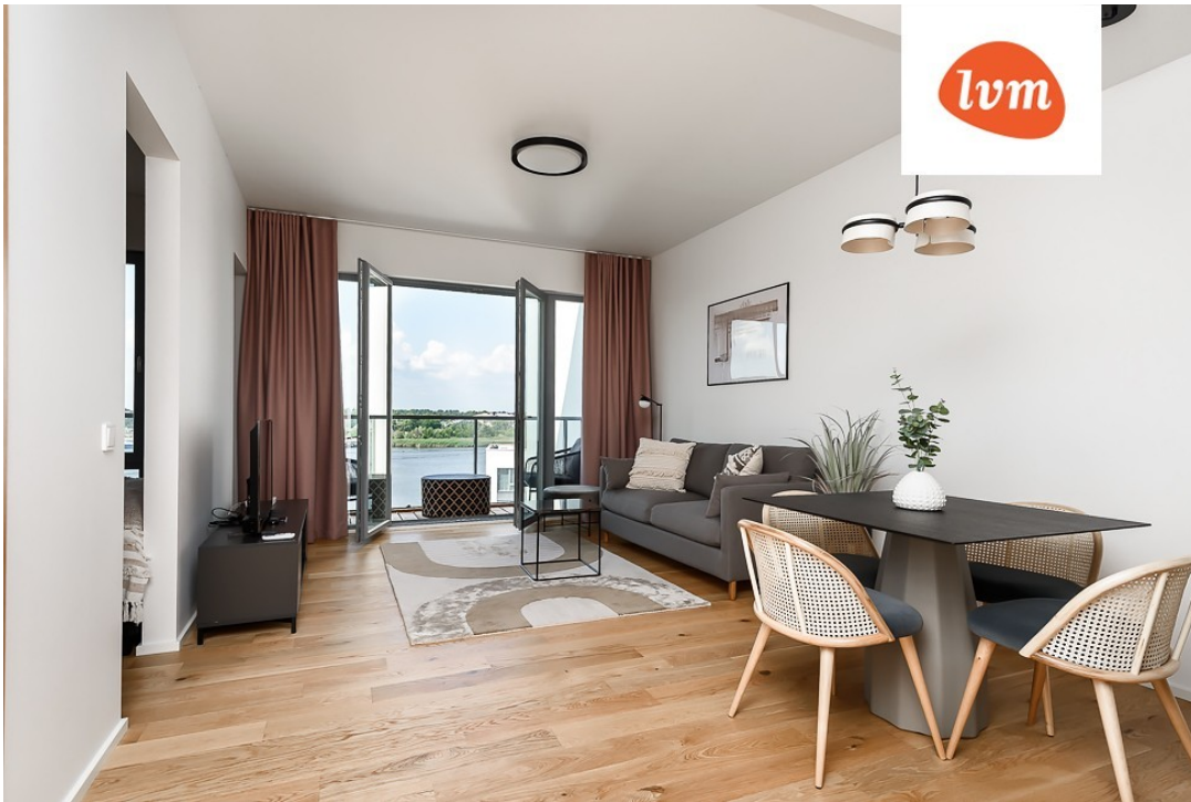
????????, Ringi 60-33